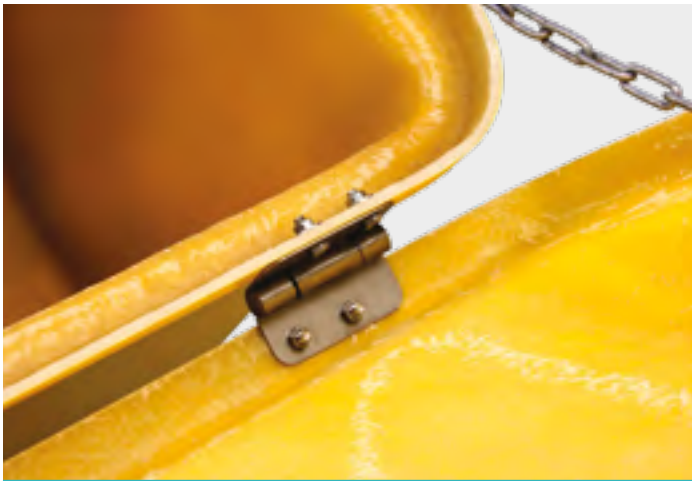
stainless steel hinge detail