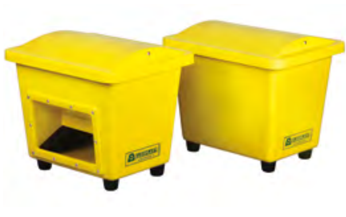
SBA 110 with/without emptying opening.