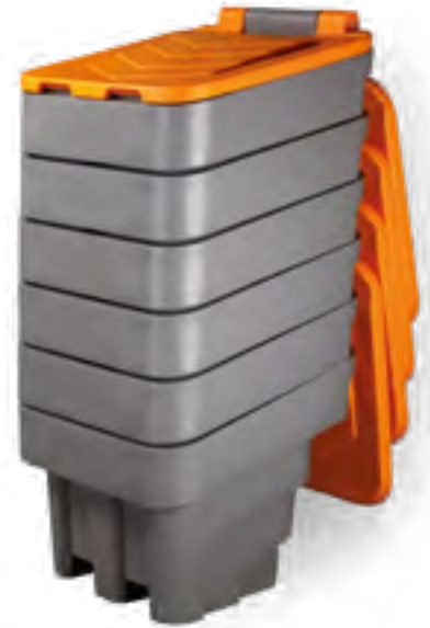
STACKED GRIT BINS